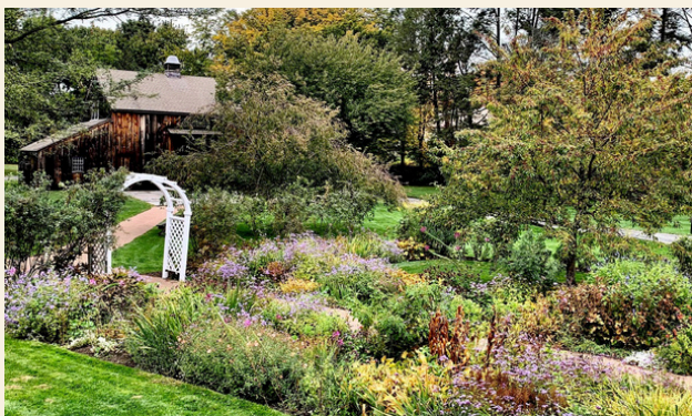
The Webb Deane Stevens Museum is accredited by the American Alliance of Museums.

The Museum has been owned by The National Society of The Colonial Dames of America in The State of Connecticut (NSCDA-CT) since 1919.